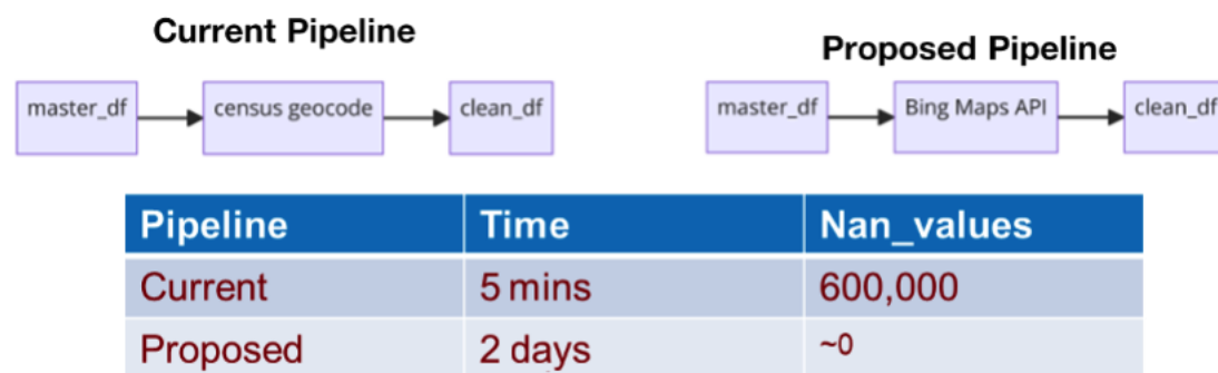
Figure 2: Proposed Bing Maps Geocoding

More accurate geocoding through Bing Maps has significantly reduced the number of missing location values to negligible levels, as illustrated in Figure 2. This effort enhances the reliability and accuracy of the data available on the website, providing users with a clearer picture of workplace safety and industry standards.